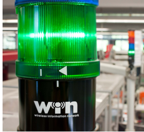
TRW Blumberg has been using WERMA signal towers for years and thereby ensures simple and effective machine monitoring and transparency in Production.

TRW has become an exemplary user of the WIN system giving much valuable feedback to the WIN development team. In this way modifications and new ideas to the product hardware and software can be introduced quickly.