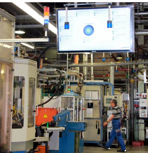
TRW Automotive insists on signal devices from WERMA. The automotive manufacturer has installed large plasma screens in various locations to display machine monitored data.

In no time it was clear that WIN was meeting all of TRW's expectations in terms of flexibility, standardisation and ease of expansion of the system. Data is transmitted wirelessly to a central master PC – no complex interface with the individual machine is required as the system simply transmits data from the existing machine tool signal tower.